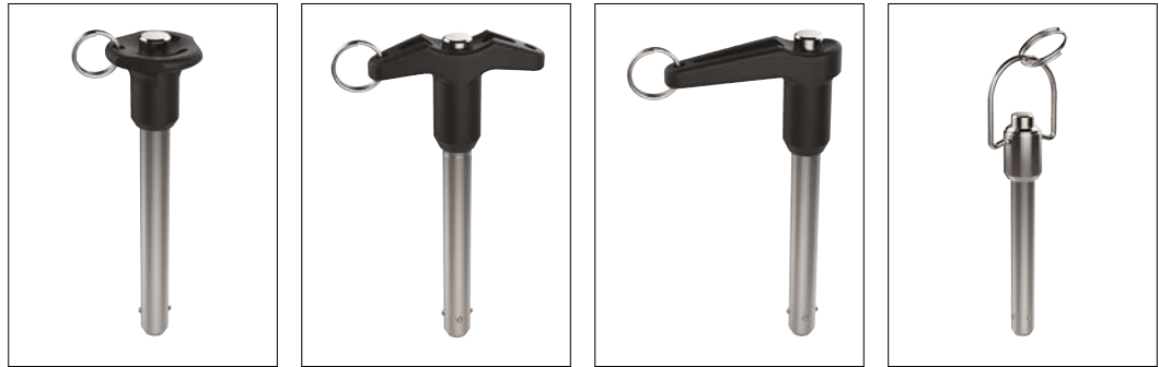
33600 - Single acting Pip-pin, standard B handle