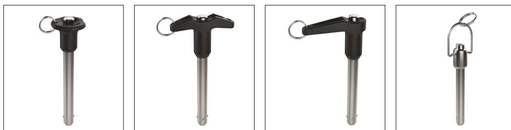
Single acting Pip-pin, standard B handle